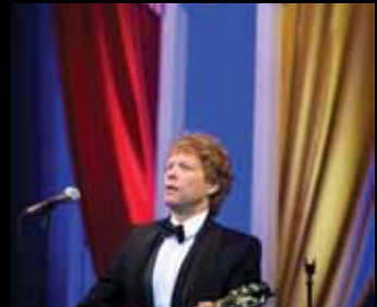
PERFORMING FOR THE PRESIDENT

The bottom line is this: If Jon Bon Jovi's creativity ages as well as his famous face, there is certainly much more to come from this enigmatic star.