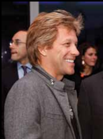
AT THE TRIBECA FILM FESTIVAL

Sure, there were other big names in that decade—but how many remain as popular and active nearly thirty years on? Jon Bon Jovi still sells out arenas. Not only that, his acting skills have earned him diverse roles in film and television. He is active in philanthropy and politics, and despite turning 53 years old this month, he shows no signs of slowing down. So where did all this youthful bravado come from, and how on earth does he sustain it? Let's take a look at his psychic profile to find out.