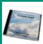
Guardian Angel Meditation CD £10