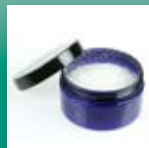
Natural Bath Salts £13.50 each (available in Michael, Gabriel, Raphael)