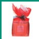
Twin Flame candle Burns 35 hours Best-seller £30