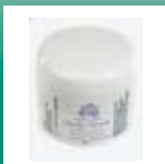
Cheeky Cherubs Moisturiser £15