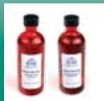
Duvet Dancing Bed Linen Mist £12.50 Sensual Massage Oil (100 ml) £15