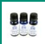
Archangel Essential Oil Blends Call for price