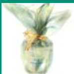
Archangel Raphael Scented Candle £30