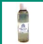
Cheeky Cherubs Organic Bodywash £13