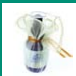
Gaia's Touch Hand Smoother £10